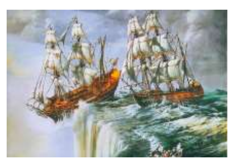
Is the world 'flat' ...

Department of Sociology and Social Work University of Wisconsin-Stevens Point